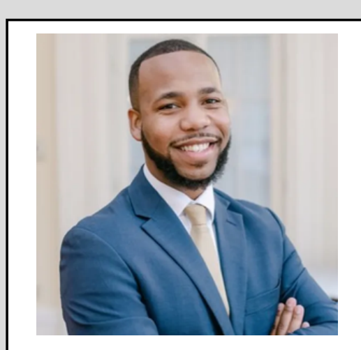
SC Rep. Deon Tedder SC District 109 https://www.deontedder.com