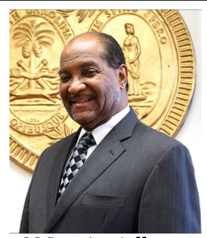
SC Rep. Joe Jefferson SC House 102 https://jefferson102.com