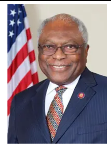
Congressman James Clyburn US Congress, District 6 https://clyburnforcongress.com