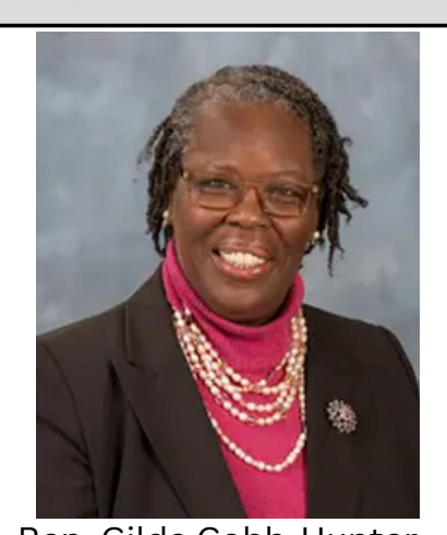
Rep. Gilda Cobb-Hunter SC House 95 https://twitter.com/GCobbHunter