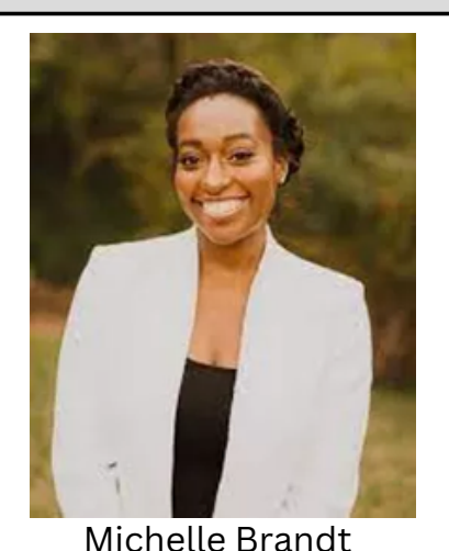
SC House 114 https://michelleforsc.com