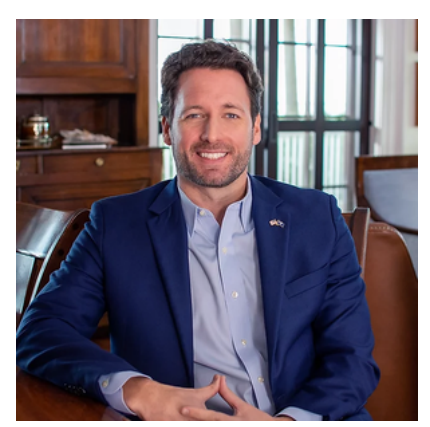
Joe Cunningham SC Governor https://www.joeforsouthcarolina.com