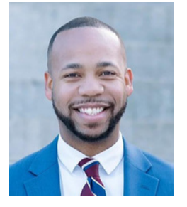
Incumbent Senator Deon Tedder State Senate, District 42